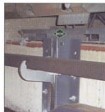
Positive Contact Hook captures and holds all legal ICC Bars.

CHALFANT offers a complete line of finely crafted, technologically advanced loading dock equipment, including Mechanical and Hydraulic Pit Levelers, Edge-of-Dock and Top-of-Dock Levelers, Portable Dock Boards, Vehicle Restraints, Dock Seals and Shelters , plus other quality accessories. Just call us for personal, professional customer assistance and responses to all of your product needs.