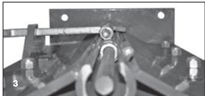
3 - Standard ground mounting plate for additional holding strength.