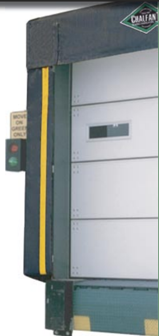
*With optional wear pleats, guide stripe is on the first four pleats although optional full-length stripe is also available upon request

Chalfant has pioneered, developed and provided the industry with quality loading dock equipment since 1940. Safe, affordable, reliable dock equipment for your application needs.